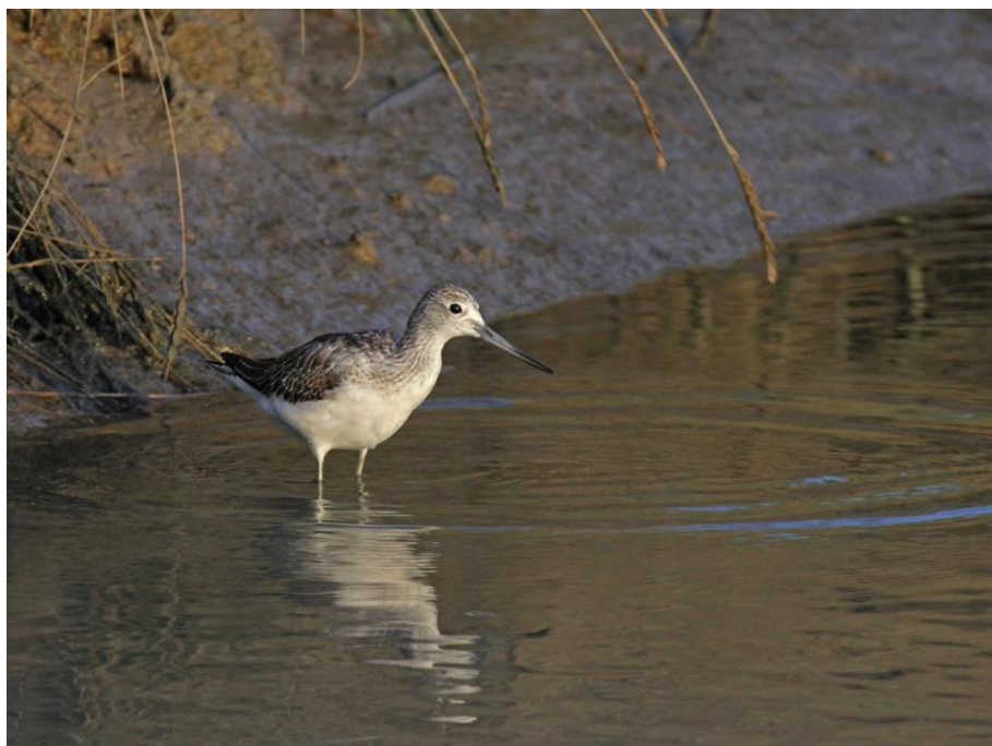
Greenshank near the sluice