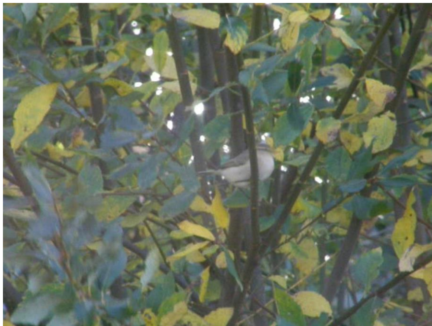
Poor video grab of the Eastern Chiffchaff

One was at Sandy Close Pond on 15 th Nov. Unfortunately it was silent and therefore confirmation as P.c.tristis was not possible.