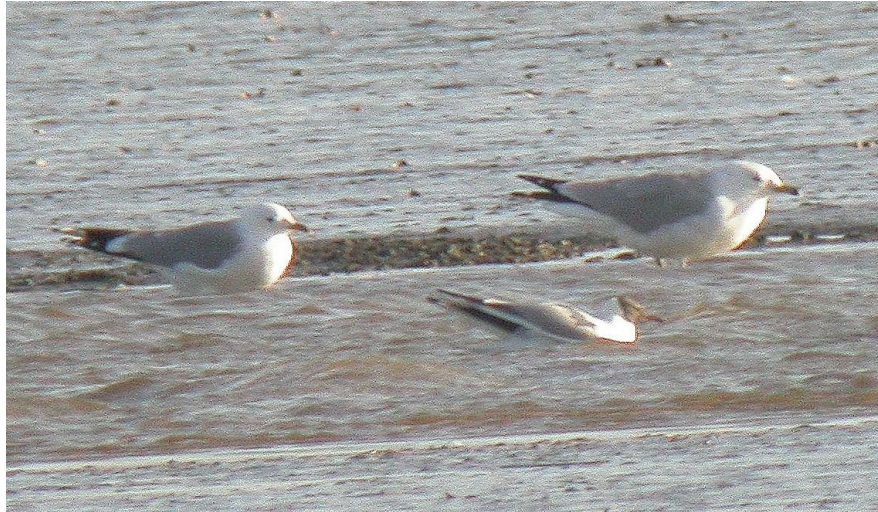
Ring-billed Gull March 2009. S. Robson