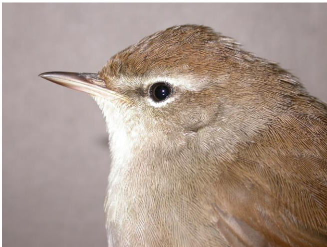
Cetti's Warbler, Sandy Close Pond, Dec

Breeding resident. 8 territories again this year. Better than expected given the cold winter preceding the breeding season. A young male remained at Sandy Close Pond from 28 th July until the year end. 7 ringed.