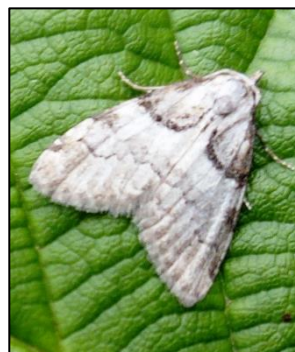
Fig.25 Short-cloaked Moth

2077 Short-cloaked Moth Nola cucullatella – Common and fairly widespread resident, the larvae feed on Hawthorns, Blackthorn, Apple, Pear, Plum. 7 recorded on 5 occasions in 2018 and 2019. (5,7)