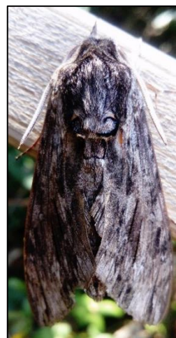
Fig.9 Convolvulus Hawk-moth

1972 Convolvulus Hawk-moth Agrius convolvuli – Scarce and local migrant / wanderer, the larvae feed on Bindweeds and other convolvulaceae. One on 21 st August 2018, 2 on 9 th September 2018. Elsewhere recorded singly in 2 other sites by the MoPH project. (2,3)