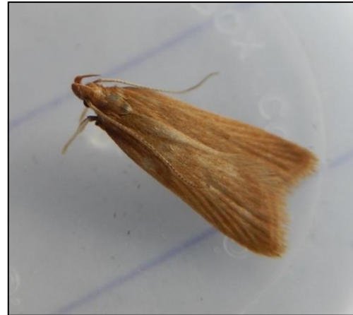
Fig.15 Helcystogramma rufescens

868 Helcystogramma rufescens – Fairly common and widespread resident, the larvae feed on a selection of grasses, especially Wood Small-reed and False Brome. Singles on 9 th June and 8 th July 2019, confirmed by Dr Phil Sterling. (2,2)