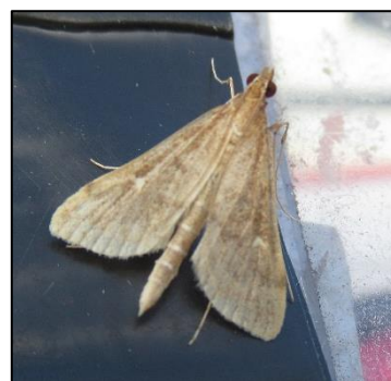
Fig.11 Dolicharthria punctalis

1399 Dolicharthria punctalis (Nationally Scarce B) – Uncommon and thinly distributed and restricted coastal resident, the larvae feed on Bird's-foot Trefoil, Red Clover, and Buckshorn Plantain. One on 23 rd July 2018 the sole record. Recorded in 2 x 1km squares on Living Record 2000-2019. (1,1)