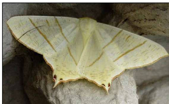
Fig.27 Swallow-tailed Moth

1922 Swallow-tailed Moth Ourapteryx sambucaria – Common and widespread resident, the larvae feed on broadleaved woody plants, Hawthorn, Blackthorn etc. 12 recorded on 4 occasions in 2018 and 2019. Maximum 6 on 9 th July 2018. (4,12)