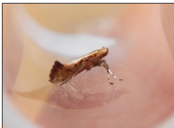
Fig.5 Calybites phasianipennella

296 Calybites phasianipennella – Scarce and restricted resident, larvae feed on Water Docks, Loosestrifes and Knotgrass. Singles on 8 th and 15 th September 2020. (2,2)