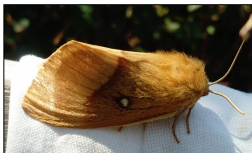
Fig.19 Oak Eggar

1637 Oak Eggar Lasiocampa quercus – Fairly common and thinly distributed resident, the larvae feed on Heathers, Bilberry, Bramble and other woody plants. One on 23 rd July 2018 the sole record. (1,1)