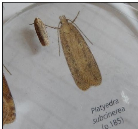
Fig.21 Platyedra subcinerea

808 Platyedra subcinerea (Nationally Scarce B) – Scarce and thinly distributed resident, the larvae feed on Common Mallow and Hollyhock. One on 20 th May 2019 the sole record. This is apparently the only record for Poole Harbour this century. (1,1)