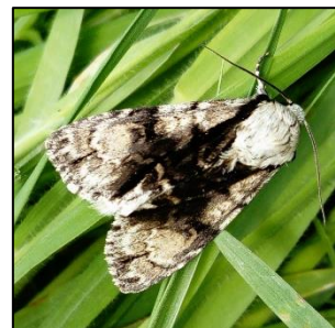
Fig.2 Alder Moth

2281 Alder Moth Acronicta alni – An uncommon and thinly distributed or restricted resident. Larvae feed on broad-leaved trees especially Alder. Singles on 14 th and 28 th May 2018 had presumably wandered from lower ground. (2,2)