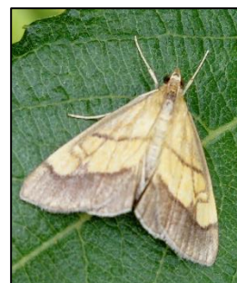
Fig. 13 Evergestis limbata (this individual photographed at Carey Estate)

1356a Evergestis limbata (Nationally Scarce B) – Rare and very local recent resident, the larvae feed on Hedge Mustard and Garlic Mustard. Singles on 9 th July 2018 and 8 th September 2020. (2,2)