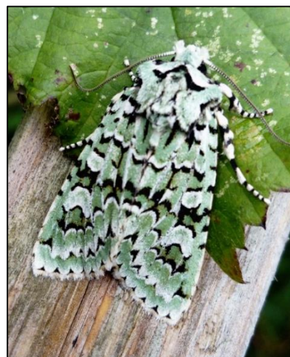
Fig.17 Merveille du Jour

2247 Merveille du Jour Dichonia aprilina – Fairly common and widespread resident, the larvae feed on Oaks. One on 15 th October 2018. (1,1)