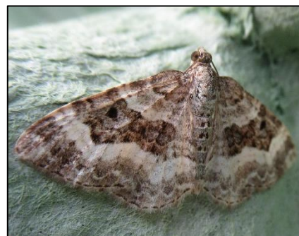
Fig.29 Wood Carpet

1739 Wood Carpet Epirrhoe rivata – Rare and very local resident, the larvae feed on Lady's and Hedge Bedstraw. One on 23 rd July 2018 the sole record. This is apparently the only Poole Harbour record this century. (1,1)