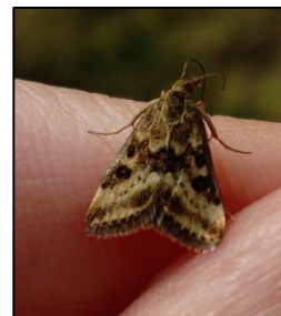
Fig.23 Pyrausta despicata

1365 Pyrausta despicata – Fairly common and widely distributed resident, the larvae feed on herbs like Wild Thyme and Marjoram. One on 21 st August 2018 and 2 on 9 th September 2018 the only records. (2,3)