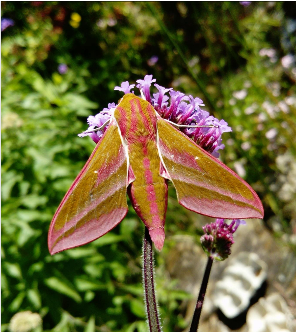
Elephant Hawk-moth at Carey Estate